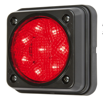
PM-1217G-R-417 surface mount