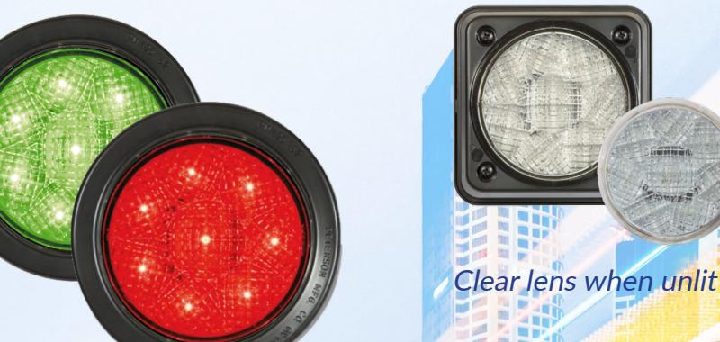
PM-1217G-R-426 Flush mount