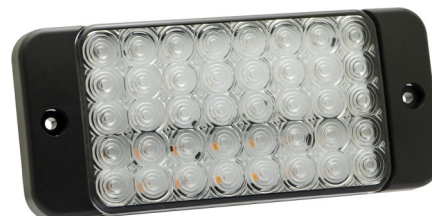
Appears clear when unlit